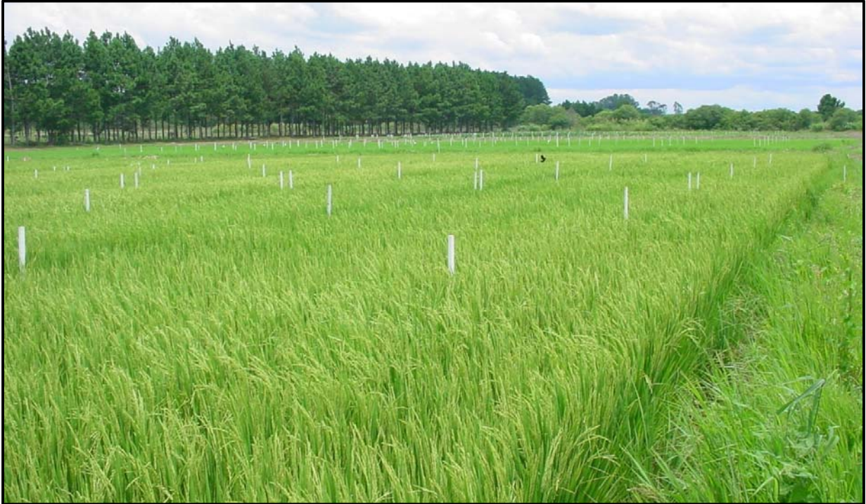
Commercial rice production by farmers – Land leveling ( 6°. Stop )