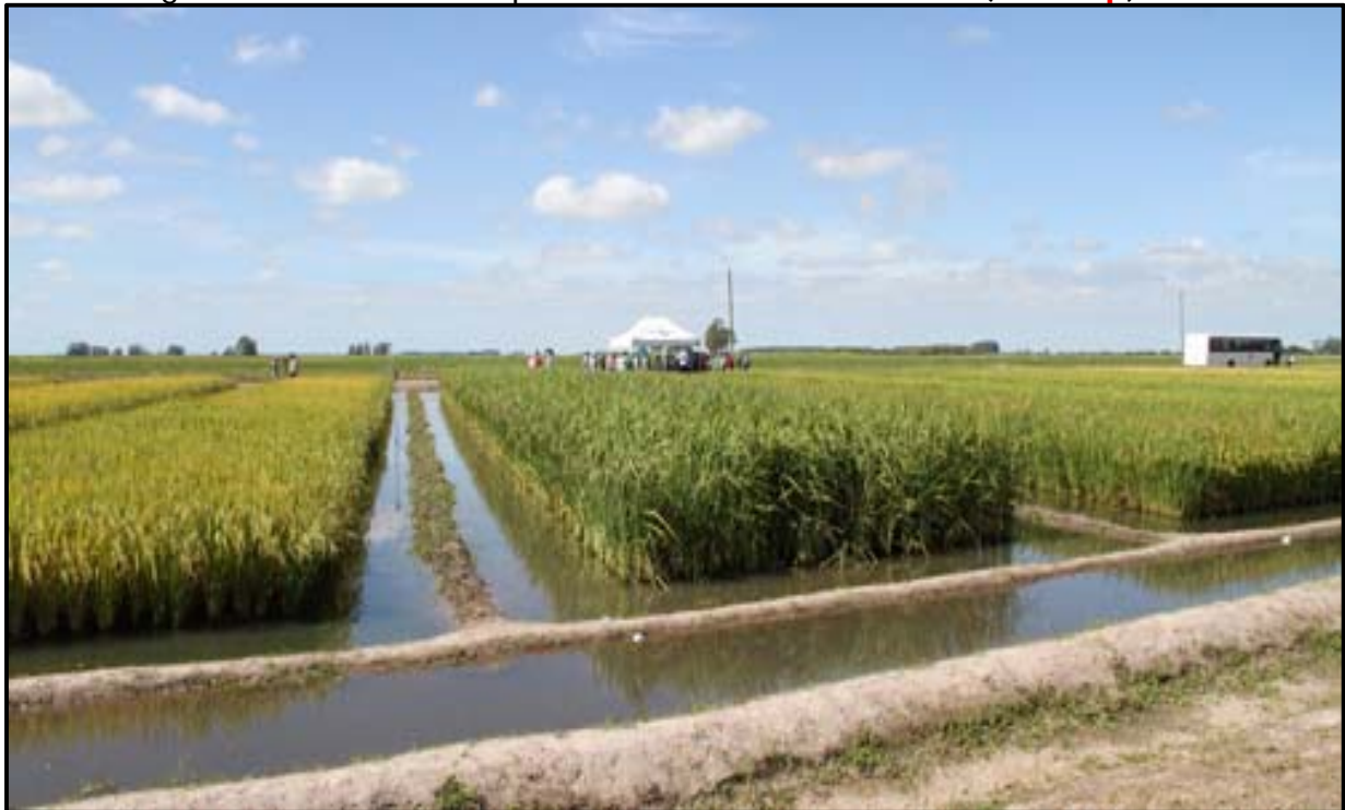
Rice Experimental Station - Federal University of Santa Maria (5°. Stop)