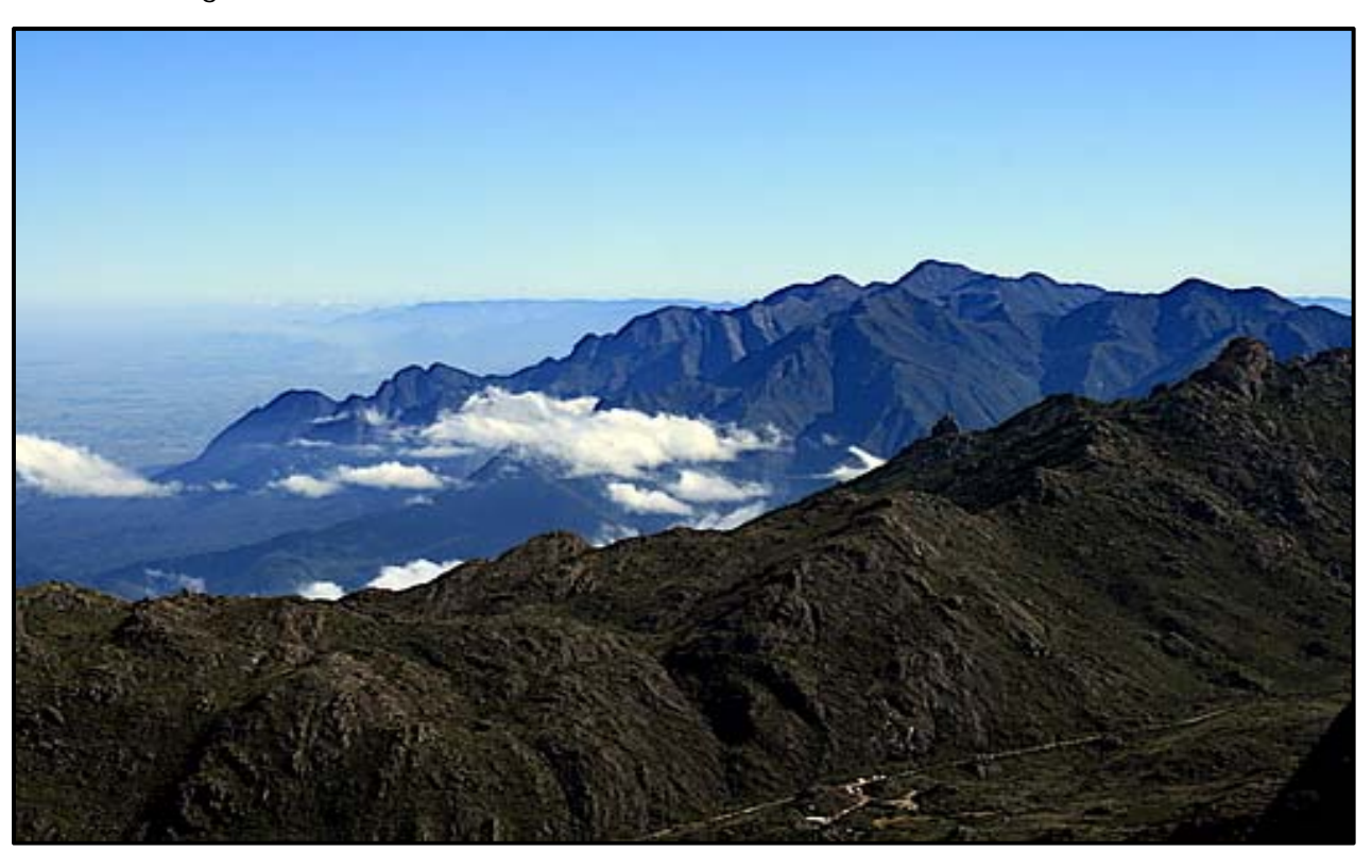
Black needle pick – The highest elevation point

Highlands of Itatiaia, one of the highest mountains in Brazil, on alcaline rocks of Late Cretaceous age.